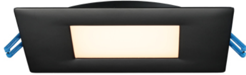
Type IC, Wet & Air-Tight